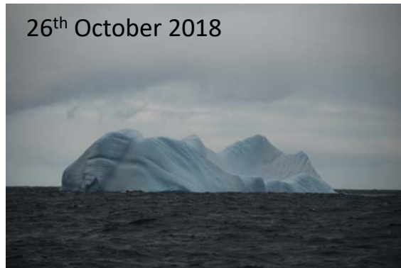
26 th October 2018